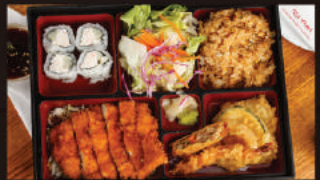
CHICKEN KATSU BENTO - LUNCH

# No Fried Rice . Dinner is available for 3.00 more