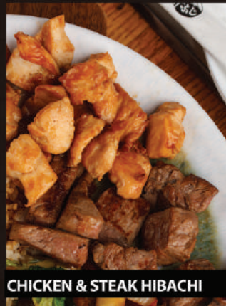
CHICKEN & STEAK HIBACHI