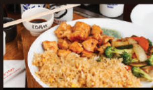
STEAK & SHRIMP HIBACHI-LUNCH