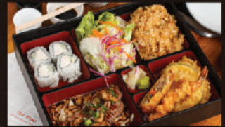
BEEF TERIYAKI BENTO- LUNCH