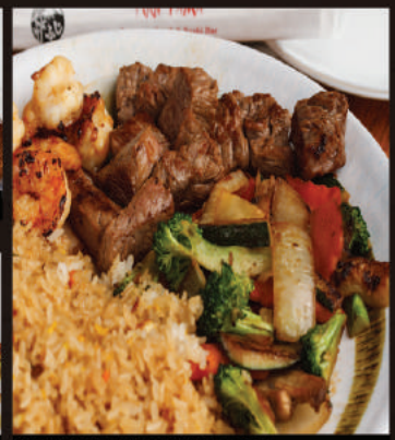
STEAK & SHRIMP HIBACHI-LUNCH

*Consuming raw or undercooked meats, poultry, seafood, shellfish or eggs may increase your risk of foodborne illness