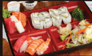
SASHIMI BENTO- LUNCH