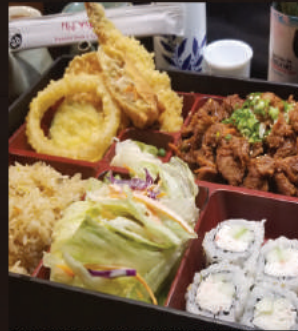
BULGOGI TERIYAKI BENTO- LUNCH