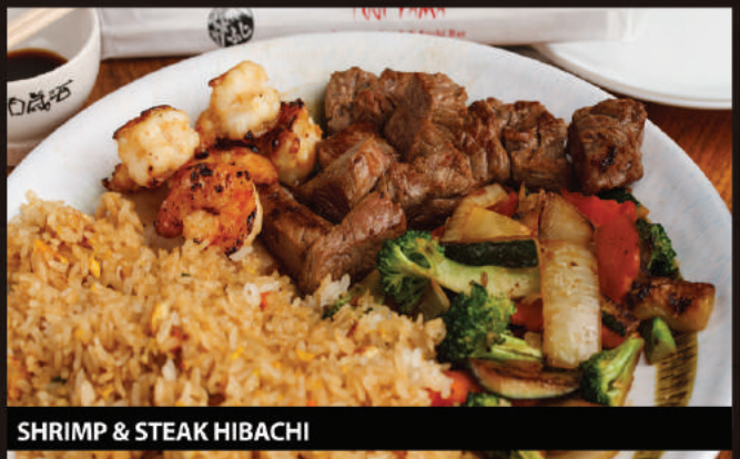
SHRIMP & STEAK HIBACHI

Vegetable portion may be substituted for extra fried rice. no rice, extra vegi, 3.00