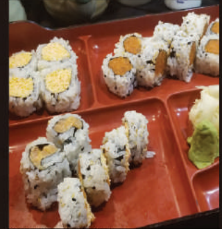
ROLL BENTO- LUNCH