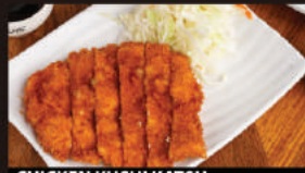
CHICKEN KUSHI KATSU