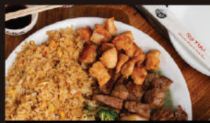
STEAK & CHICKEN HIBACHI-LUNCH