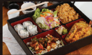
SHRIMP TERIYAKI BENTO - LUNCH